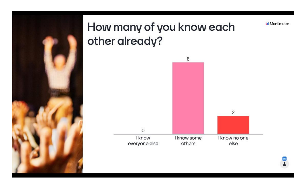
Figure 4: Responses to those who know each other already

This group will be consulted and involved throughout the length of the MOVING project with specific activities for engagement occurring 3-4 times per year. A breakdown of the key activities for the group is highlighted at the end of this report.