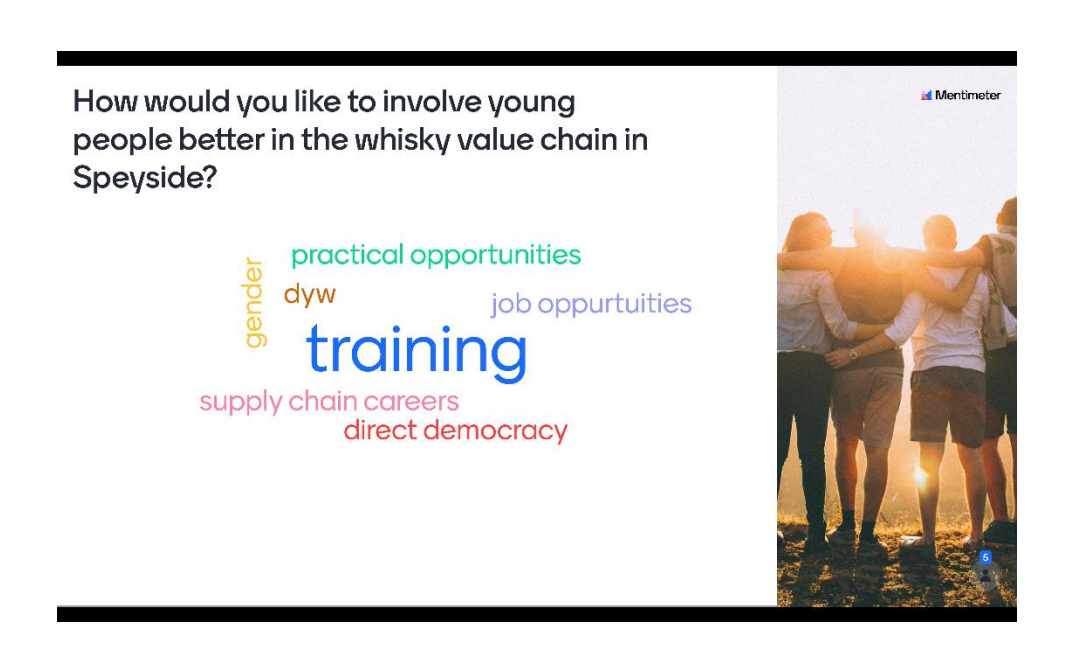
Figure 5: Suggestions for how to better involve young people in the value chain

From the Mentimeter results, it was clear that youth opportunities and engagement in the sector/area could be improved (see Figure 5 below). Involving the Cairngorms Youth Action Team was suggested. However, others pointed out that it can be tricky in their organisations to focus solely on young people as they have a remit to represent all working-age populations. Involving young adults is difficult given the age restrictions on whisky products, although there is a general interest in skills and training for the wider value web (transport, tourism, energy). These are important aspects for us to consider moving forward in the project.