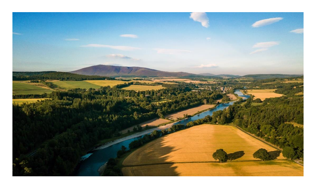
Figure 1: River Spey.

20<sup>th</sup> July 2021 – 1.30pm-3.15pm