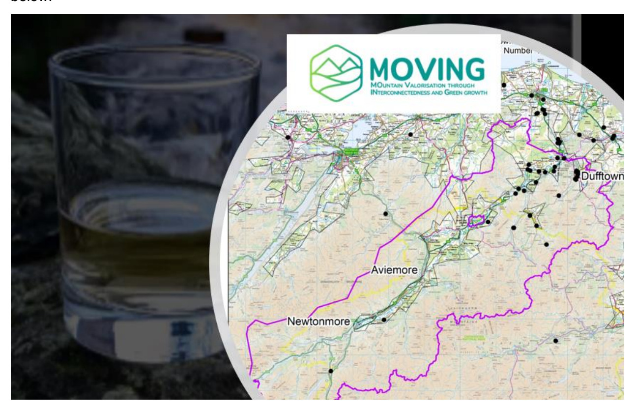
Figure 2: Whisky Distilleries in our Mountain Reference Landscape (MRL outlined in cerise and distilleries illustrated by black dots, Map produced by Jon Hopkins using ONS/ European Environment Agency data.

After an initial activity mapping a range of mountain value chains across the UK, we selected Speyside whisky as our value chain and Badenoch and Strathspey as our Mountain Reference Landscape (case study area). The area, along with some of its key distilleries, can be viewed below.